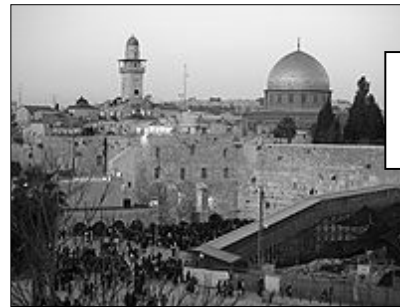
Wailing Wall and Temple Mount

This is not considered a final tally by any means and there are no obligations with this, but it will help us make the best choice of tour packages at the best rate.