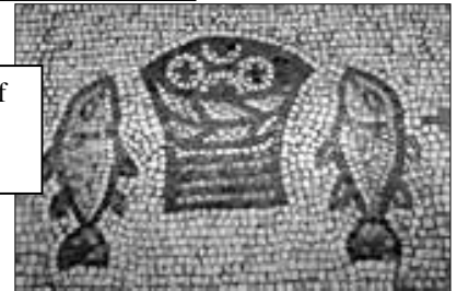
Byzantine Mosaic of Loaves and Fish at Tabgha