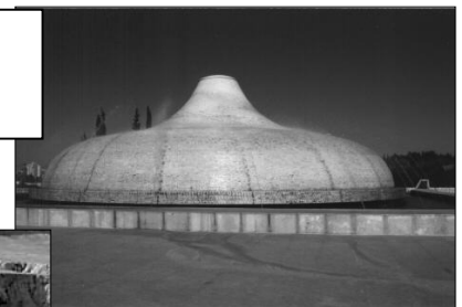
Shrine of the Book / National Museum of Israel