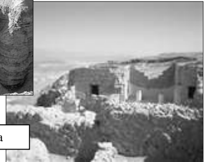
Ruins at Masada